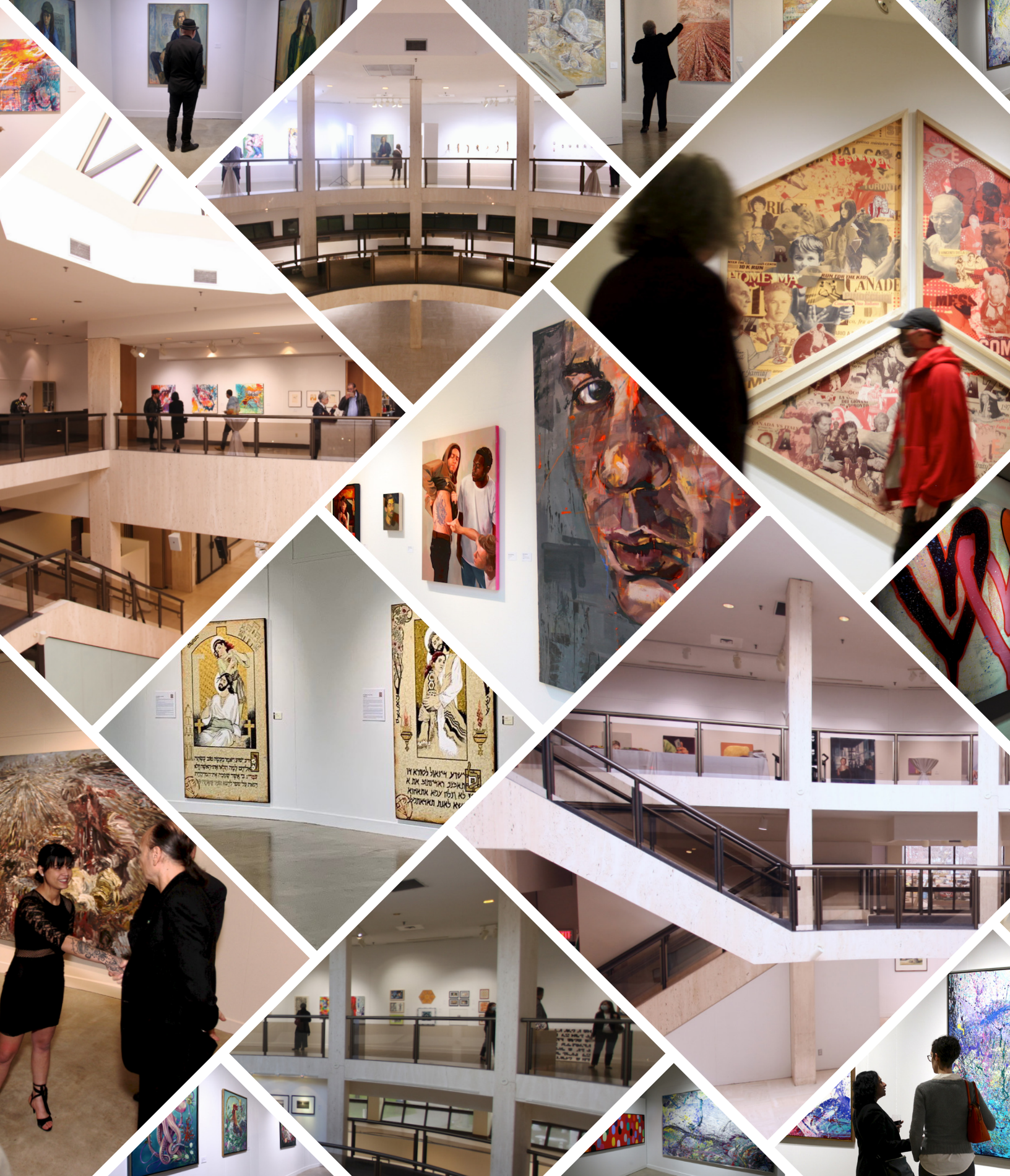
Joseph D. Carrier Art Gallery, Columbus Centre 901 Lawrence Ave. West, Toronto, ON, M6A 1C3