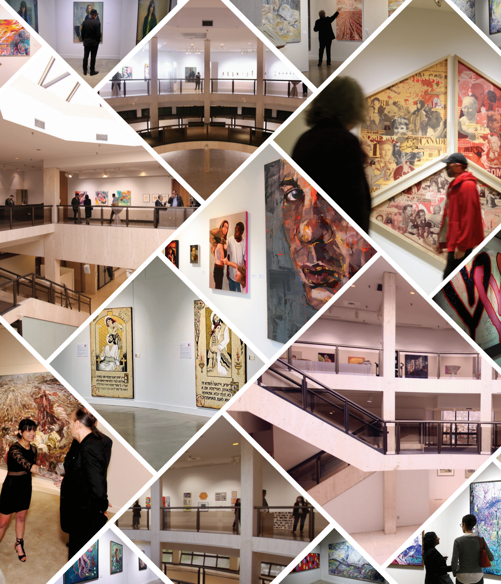
Joseph D. Carrier Art Gallery, Columbus Centre 901 Lawrence Ave. West, Toronto, ON, M6A 1C3